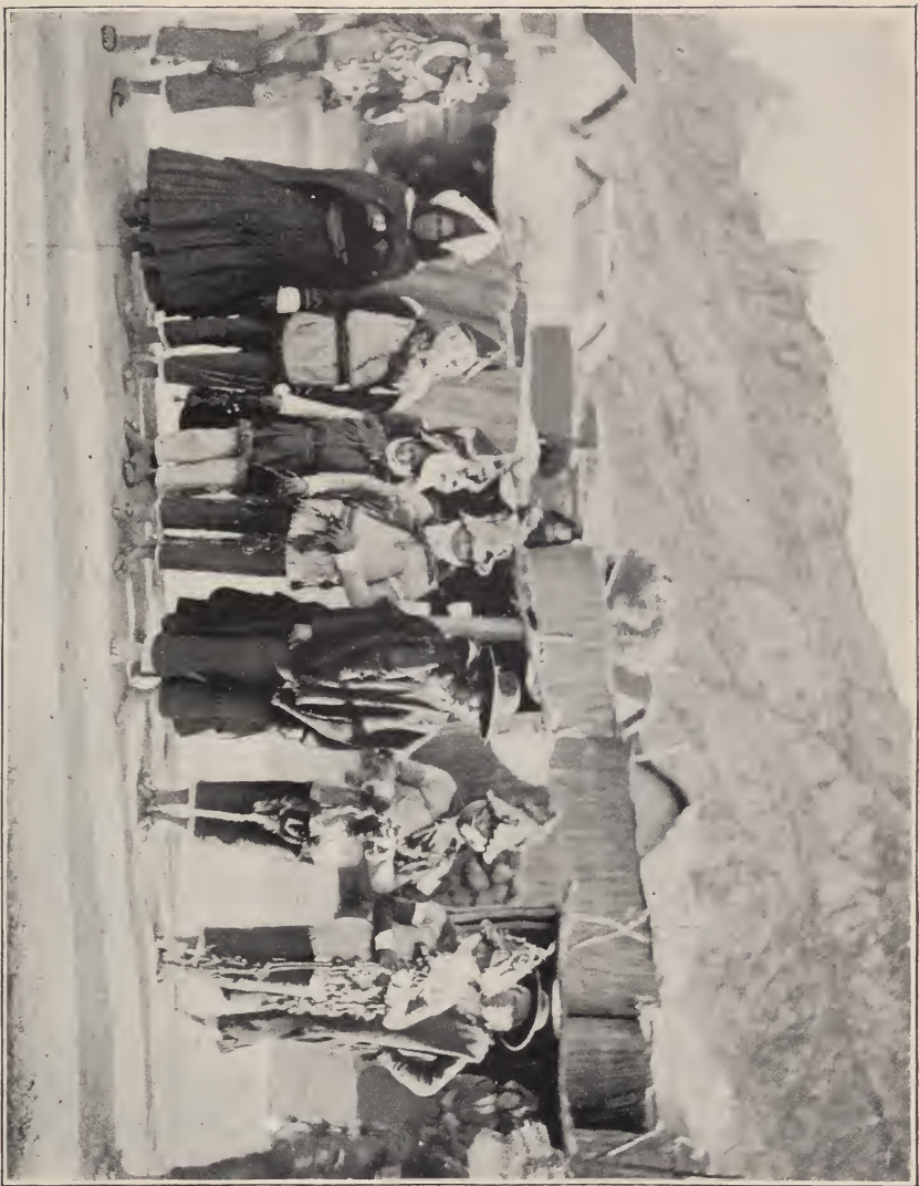
A GROUP OF AYMAR INDIANS, LAKE TITICACA, PERU.